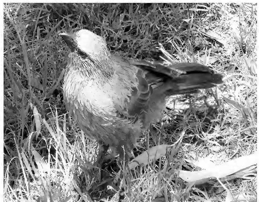
Figure 1. An apostlebird Struthidea cinerea at the Pinegrove Lawn Cemetery, Minchinbury.

The apostlebird ( Struthidea cinerea ) (Fig. 1), a conspicuous gregarious passerine, is abundant in the inland areas of eastern Australia, with an isolated population in the Top End, Northern Territory (Fig. 2). Changes in the distribution in last century were well-documented, showing that at least half its current range was penetrated in the last 100 years (McAllan and O'Brien 2001; Barrett et al. 2003). Habitation of some localities apparently occurs in response to climatic conditions, receding in times of drought (Mack 1967).